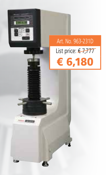
HR-320MS (963-231D) Dual type (Rockwell/Rockwell superficial) hardness testing machine

Although an economic model, a switching dial for full test force, or automatic handle brake for handle operation support and automatic start function are standard features. The load sequence for full test force is motor-driven.