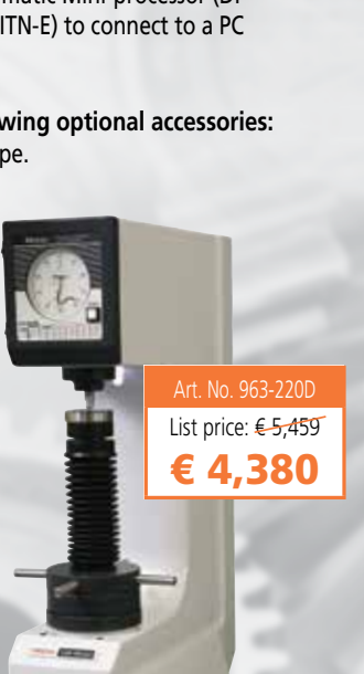
HR-210MR (963-220D) Rockwell hardness testing machine

Environmental friendly model without power supply. Starting from weight changing (election of full test force), all basic handling operations are performed manually.