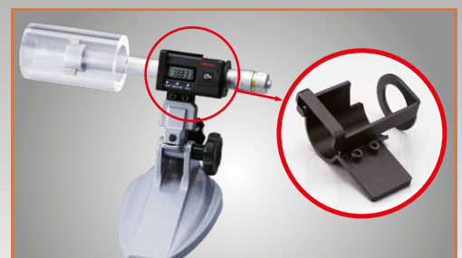
HOLDER FOR MICROMETER STAND 04AZB157 incl. Micrometer Stand 156-101-10