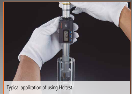
Typical application of using Holtest